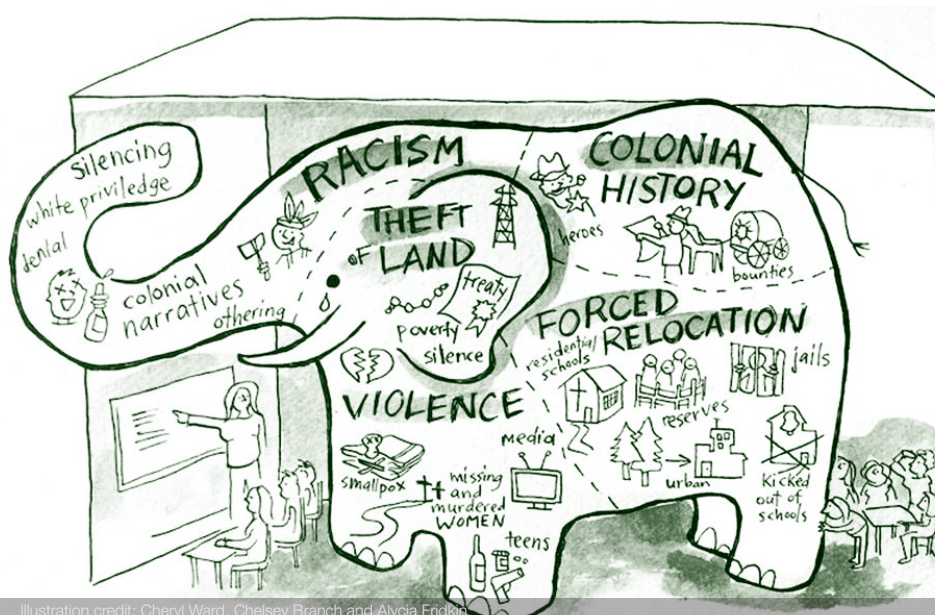
The colonial elephant in the room 9

from themselves. San'yas learners are often surprised to learn that a cultural safety approach to providing care is about paying attention to the roots of health and health care inequities, such as colonization.